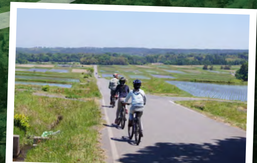
Japanese traditional roads of countryside (afternoon course)