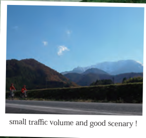
small traffic volume and good scenery !