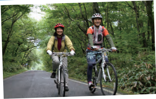
looks like tunnel of trees [We can see blue sea soon]

Discover nature, history and regional foods of Mt. Daisen