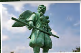
The statue of legendary ghost (afternoon course)