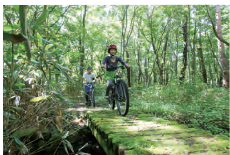
exciting ancient path