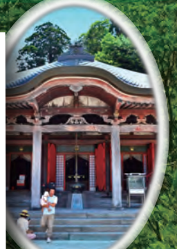
Enjoy nature & history of Mt. Daisen (hiking include only morning course)